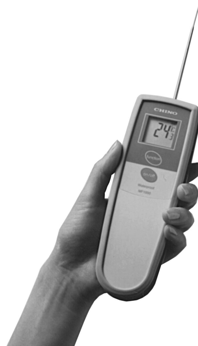
Temperature measurement by fitting the sensor to the backside of the thermometer