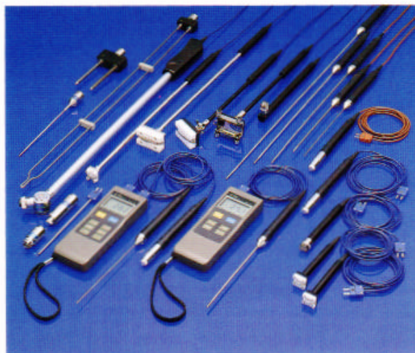
19 types of sensors to match user's need